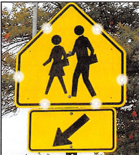
School Crossing (S1-1)