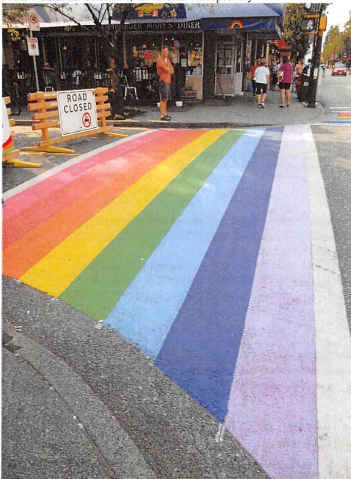
Size of this preview: 450 × 600 pixels.

From Wikimedia Commons, the free media repository