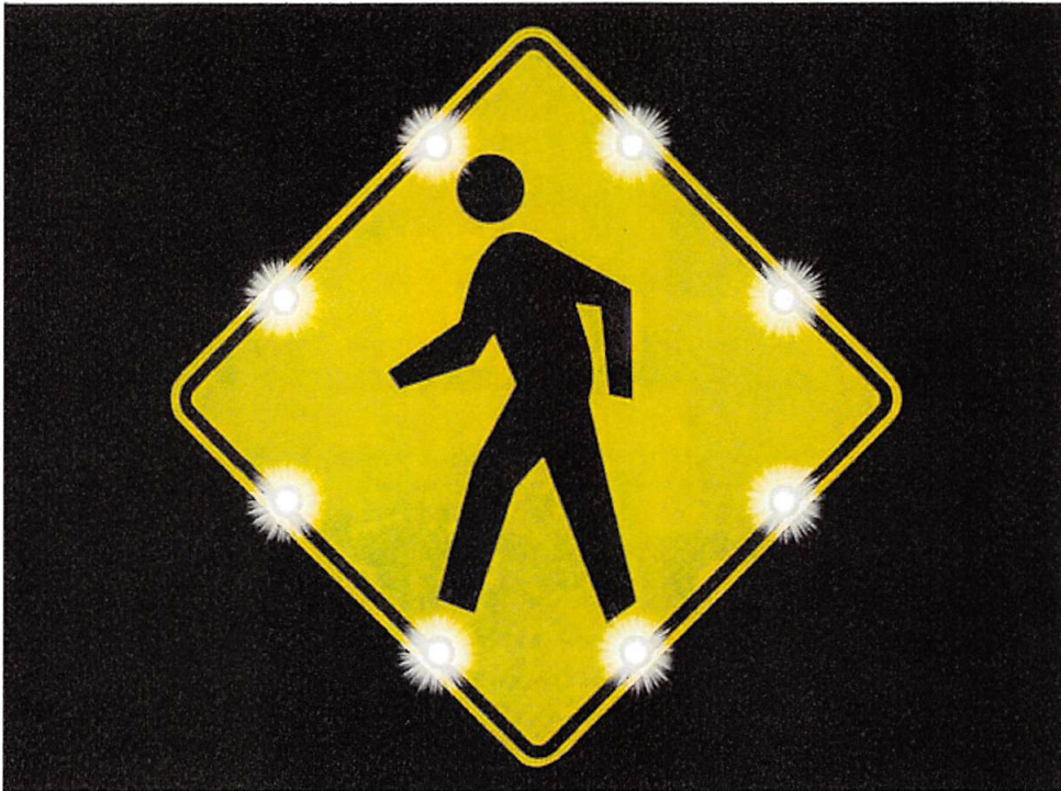
Pedestrian Crossing (W11-2)