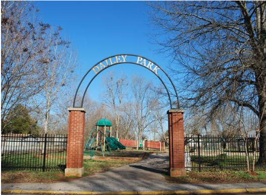
George S. Dailey Park, Selma Road, Montevallo, AL