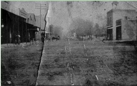
Early Main Street Montevallo,

Do you know of a location significant in Montevallo's African-American history? If so, provide us with: location, historical description, photos if available, and our contact information.