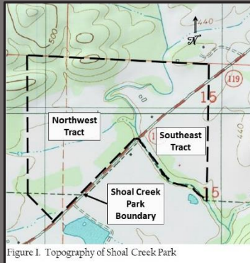
Figure 1. Topography of Shoal Creek Park

Beneath the soils of the park are two different bedrocks. Underlying the lowlands is a bedrock composed of interbedded layers of limestone (primary component,) shale and chert (secondary components.) The bedrock is a part of a geological unit called the "Conasauga Formation" that was created during the middle part of the Cambrian Period (ca. 530 million YBP.) In lower elevations of the park the Conasauga bedrock is covered by alluvium composed of sands, gravels, clays, and various-sized fragments of the underlying bedrock. The alluvium layer here has been forming during the most recent geological period (i.e. the Quaternary,) beginning ca. 1.6 million YBP (Figure 2.) The Conasauga Formation is visible at various locations within the park.